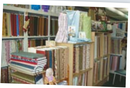
Left: Various Moda Bake Shop Jelly Rolls, Turnovers and Charm Squares, perfect for small projects, are available. Prices vary. For more information, contact Onpoint Patchwork & Needlecraft.