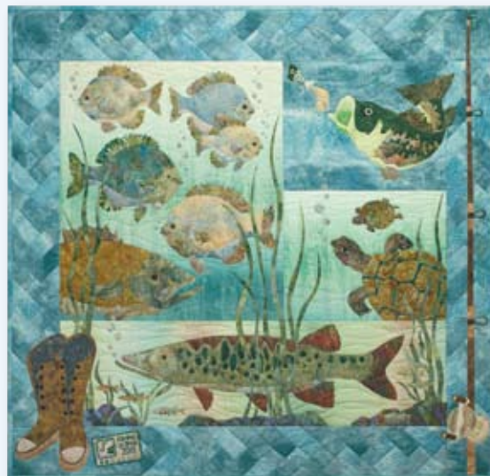
Something Fishy is the latest gorgeous design by McKenna Ryan. The completed quilt measures 42 x 44in. Contact the shop for more details.

kits and fabrics, which are all available through their secure mail-order service. With approximately 1000 different