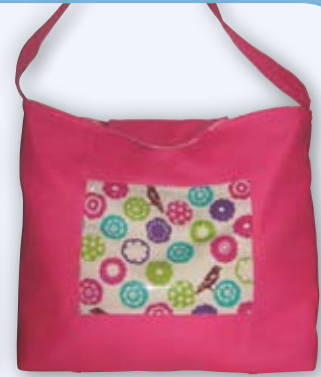
The chic JJ's Satchel is one of the shop's original Sew Selly patterns.