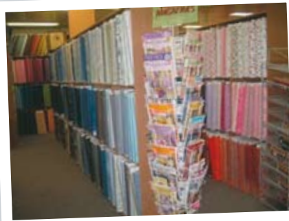
Showing two of the shop's 26 rows of gorgeous fabric.

The store has friendly staff and a warm atmosphere, so you'll never want