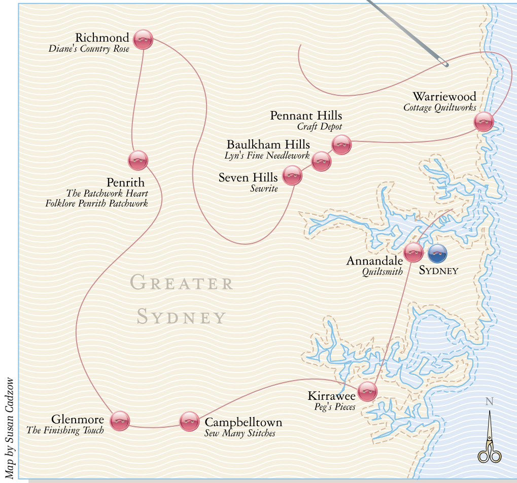
Follow the needle and thread, button by button, as we make our way around the scenic suburbs of greater Sydney.

Tourists travel from all around the world to visit the iconic sights of Sydney, the Harbour City, and thanks to Oprah Winfrey's recent visit, the city is more popular than ever. Australia's largest capital city, Sydney offers a multitude of things to see and do and caters to all tastes — from a leisurely time out to more adventurous exploration. There's so much on offer, even locals can find new and exciting things to appreciate, especially in crafting circles. So time to grab the girls, embrace Sydney's style and get up to some crafty shopping shenanigans.