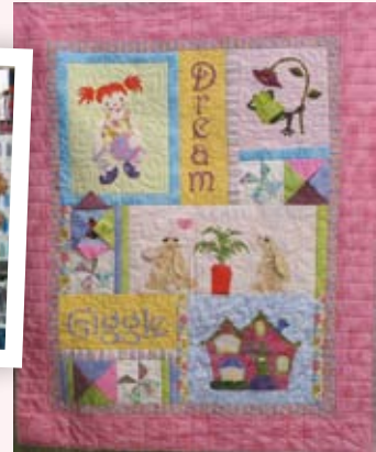
Cutie Patootie by Hissyfitz Design measures 48 x 60in. Grab the pattern for $17.80, plus $3 p&h, or a full kit including fabric for front and binding for $128.05, plus $13 p&h.

notions, fabrics and so much more. Classes by experienced tutors are held most days of the week and specialised full-day workshops are also conducted periodically by well-known Australian designers and teachers. These are advertised in store, via the shop's monthly eNewsletter and on the website.